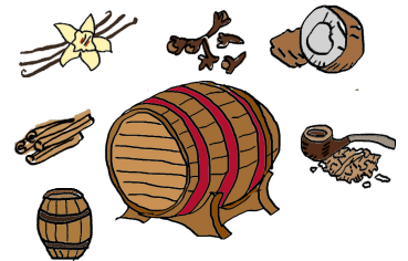
OAK AND AGED AROMAS (BAKING SPICES, OXIDATION)